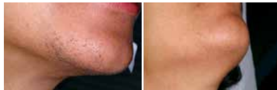
Before After 2 treatments

All photos are unretouched. Individual results may vary.