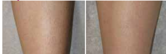
Before After 5 treatments

Remove unwanted hair anywhere on the body!