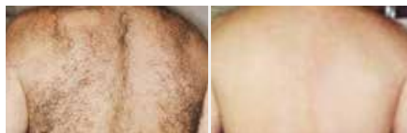
Before After 5 treatments

Courtesy of E. Victor Ross, MD, USA All photos are unretouched. Individual results may vary.